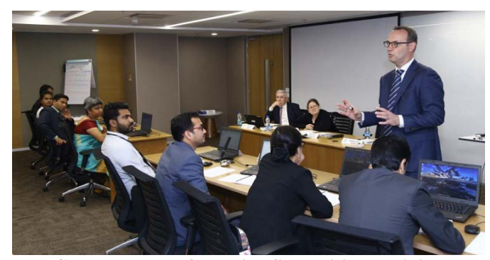
Core Elements of Banking Supervision Training April 2018

Financial Sector Regulation: Core Elements of Banking Supervision (April 9-13). The course covered supervisory topics such as corporate governance, risk management of different types of risk, in a combination of lectures with practical case studies. All countries were requested to make a presentation on their supervisory and regulatory framework and relevant developments. IMF SARTTAC's resident expert, an MCM expert from HQ, and an MCM expert resident in Nepal taught the course.