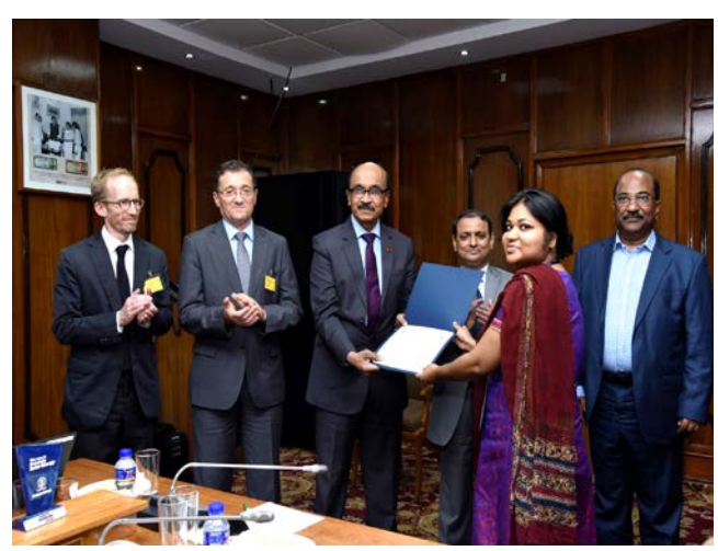
Workshop on Foreign Exchange Market Development and Operations, March 2018

over opening and closing sessions noted its relevance given Bangladesh's ambition to transform its economy to middle-income status. The workshop identified areas where a review of current practices may be desirable.