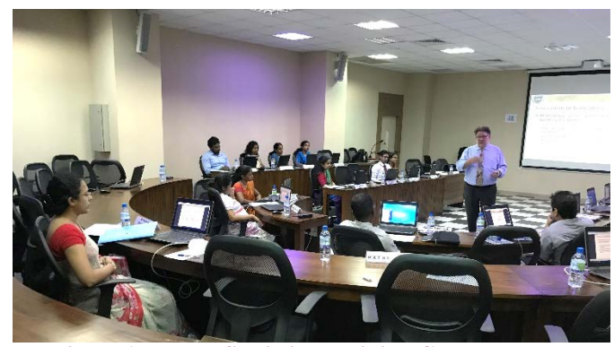
National Accounts Statistics Training Conducted at the MILODA Academy, Colombo, March 2018

Real Sector Statistics: IMF SARTTAC delivers a considerable number of national courses in country to build on its regional courses at its HQ in Delhi. In response to a request from the Department of Census and Statistics and collaboration with Sri Lanka's Ministry of Finance and Central Bank, national accounts statistics training was conducted at the MILODA Academy (March 19-23). Key outcomes included upgrading the skills of national accounts compilers and broadening knowledge to users of these statistics in the MOF and central bank.