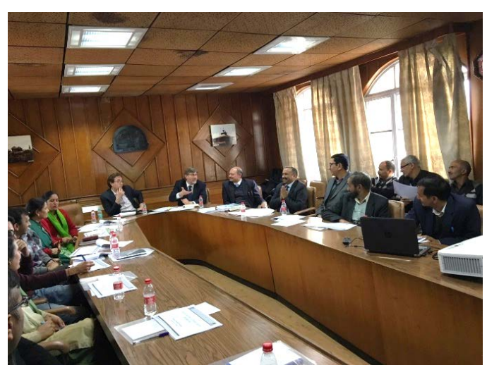
Technical Assistance Mission to Himachal Pradesh, India on Budget Formulation and Review of IFMIS Functionality, April 2018

budgeting practices, identified gaps and set out key modern budgeting principles such as introducing a multi-year perspective in budget formulation, improving macro-fiscal forecasting and introducing top down budgeting. The mission also advised on strengthening intergovernmental fiscal coordination, and reviewed the state's financial management system.