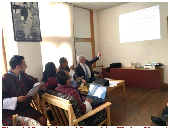
Financial Regulation and Supervision Work at Bhutan's Royal Monetary Authority, March 2018

Financial Sector Regulation and Supervision: IMF SARTTAC's approved work program includes projects to help the Royal Monetary Authority (RMA) strengthen corporate governance in financial institutions and insurance supervision (March 5-16). A team comprising SARTTAC's resident expert and a short-term expert followed up earlier work on corporate governance and initiated the work on strengthening insurance supervision. There was strong engagement from the RMA, with the Governor opening two workshops organized for financial institutions on issues related to corporate governance.