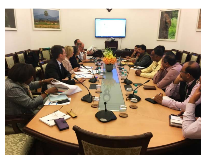
Technical Assistance Mission to India to Discuss Budgeting Practices, February 2018

In parallel with the work with the Commission, an important piece of technical assistance work was undertaken with the Union government on India's budgeting practices (February 21-March 6). This was the first IMF PFM mission to India in a decade. Using a team that comprised both IMF experts and budget officials from other G-20 economies, the mission assisted the Budget Division of Ministry of Finance in reviewing the budget formulation process, budget documentation, and comparing practices with those in other G-20 economies. The mission noted the strong financial compliance in India while also providing recommendations for modernizing budget formulation and its strategic policy orientation. The recommendations are being considered and IMF SARTTAC can provide follow up support if required. Work on improving strategic budget formulation is already planned in FY2019.