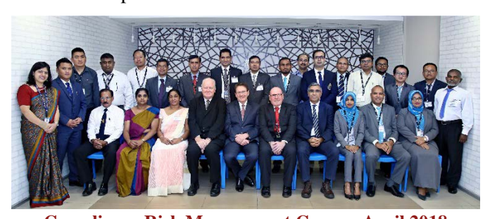
Compliance Risk Management Course, April 2018

Revenue Administration: International Survey on Revenue Administration Workshop, (April 9-13). Training was provided to all member countries on collecting tax information via the International Survey on Revenue Administration (ISORA). This framework allows them to better assess the performance of all key areas of a tax administration. Compliance Risk Management (April 23-27): a regional course on compliance risks held in April 2018 responded to demands at the earlier GST course to provide training on such core processes.